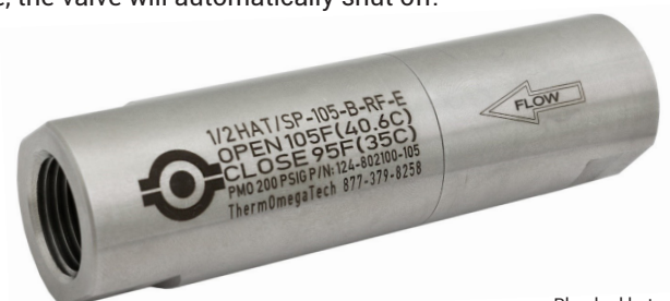
Plumbed hot and cold fluid protection