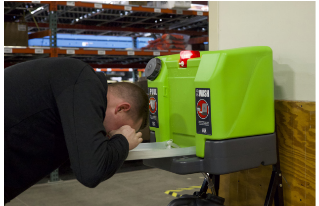
Self-contained emergency eyewash unit