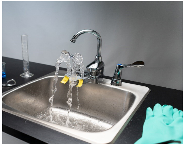
Faucet integrated eyewash