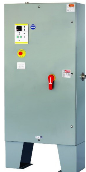
Tankless water heater

Note: a thermostatic mixing valve may be required by code in many jurisdictions because heated storage tanks cannot be relied on to maintain a safe temperature. Unheated storage tanks are not recommended for providing tepid water to emergency fixtures.