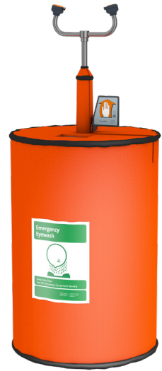
Freeze protection for self-contained units

Another common means of freeze protection involves locating the emergency equipment on a wall adjoining a heated space. The emergency equipment is located outdoors but the water supply and actuating valves are in the heated space. After use, a drain port removes standing water from the emergency equipment to prevent freezing.