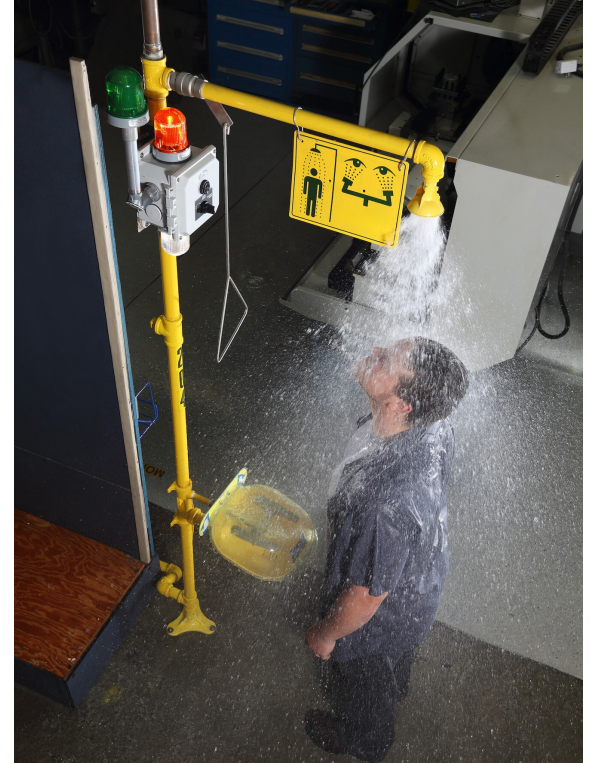
Combination shower and eyewash units