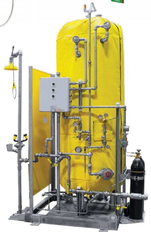
Self-contained Emergency Shower

The plumbed eyewash could be mounted in a variety of methods to include support by the supply piping, a mounting bracket to support the equipment to a fixed object such as a wall or counter top, or a pipe stand assembly referred to as a pedestal mount. The eyewash may include a receptacle ('bowl') for collection and direction of spent fluid away from the eyewash user, typically into a drain or collection sump.