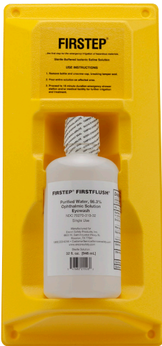
Personal wash unit