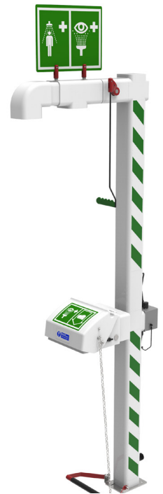
Freeze protection for plumbed equipment