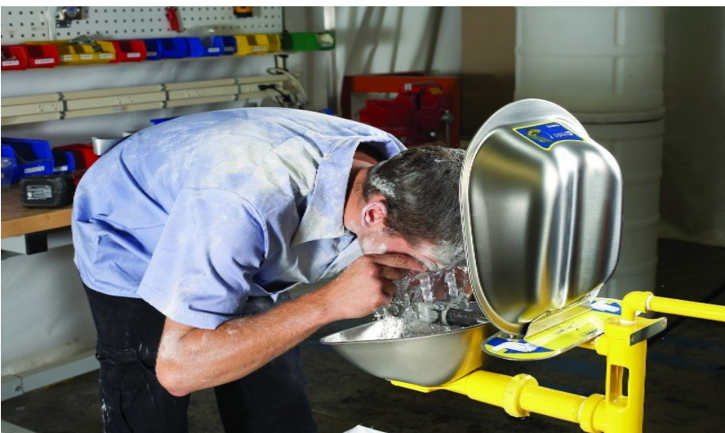
Plumbed emergency eyewash

Plumbed emergency eyewash units are fixed position installations where the flushing fluid supply provides adequate volume and pressure to meet the manufacturer's specification and the 0.4 gpm minimum 15 minute flow as specified in ANSI/ISEA Z358.1-2014 (R2020).