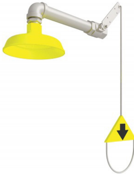
Plumbed Emergency Showers