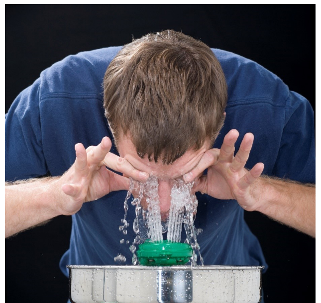
Plumbed eye/face wash unit